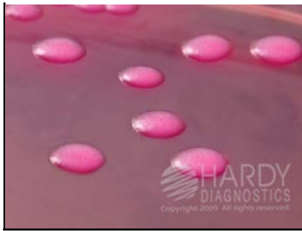
Escherichia coli (ATCC ® 25922) colonies growing on MacConkey Agar with Sorbitol (Cat. no. G36). Incubated aerobically for 24 hours at 35°C.