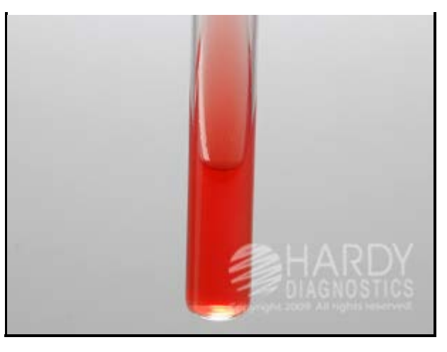
Pseudomonas aeruginosa (ATCC <sup>®</sup> 27853) growing in Kligler Iron Agar (Cat. no. L70). Incubated aerobically for 24 hours at 35°C.

Uninoculated tube of Kligler Iron Agar (Cat. no. L70).