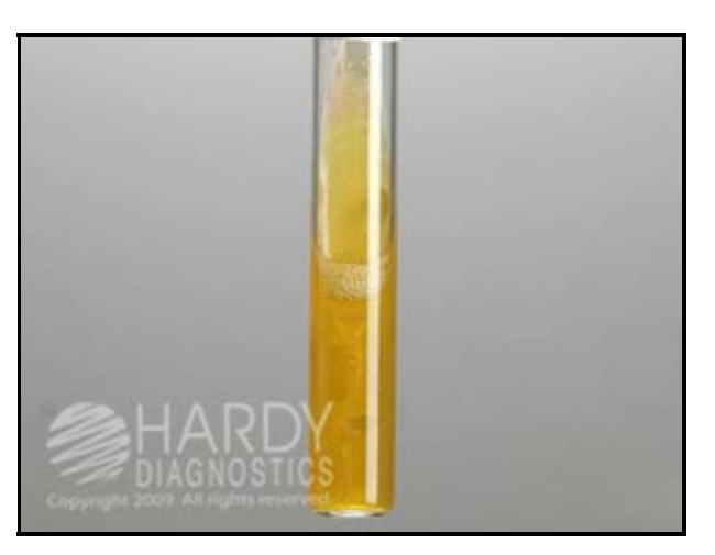
Escherichia coli (ATCC ^{\mbox{\tiny B}} 25922) growing in Kligler Iron Agar (Cat. no. L70). Incubated aerobically for 24 hours at 35°C.