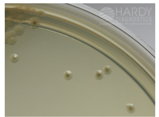
Proteus mirabilis (ATCC<sup>®</sup> 12453) colonies growing on HardyCHROM<sup>TM</sup> Sakazakii (Cat. no. G315).