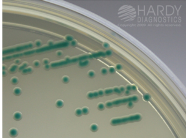
Cronobacter sakazakii (ATCC<sup>®</sup> 29004) colonies growing on HardyCHROM<sup>TM</sup> Sakazakii (Cat. no. G315). Incubated aerobically for 24 hours at 35 deg. C.

HardyCHROM<sup>™</sup> Sakazakii should appear opaque, slightly opalescent, and light amber in color.