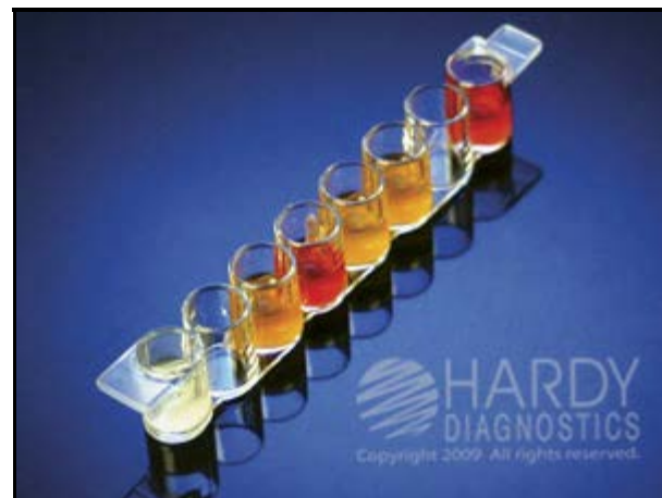
Showing results for Neisseria sicca (ATCC® 9913) with the CarboFerm™ Neisseria Kit (Cat. no. Z98).