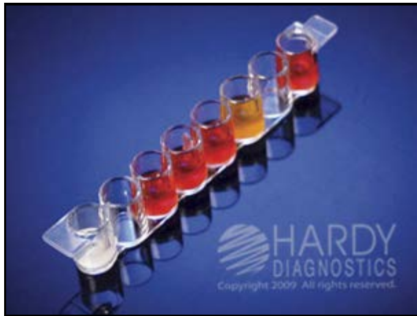
Showing results for Neisseria gonorrhoeae (ATCC® 43069) with the CarboFerm™ Neisseria Kit (Cat. no. Z98).