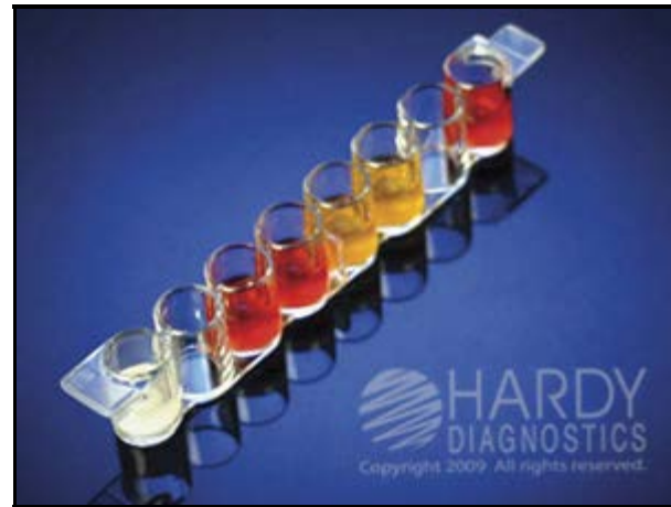
Showing results for Neisseria meningitidis (ATCC® 13090) with the CarboFerm™ Neisseria Kit (Cat. no. Z98).