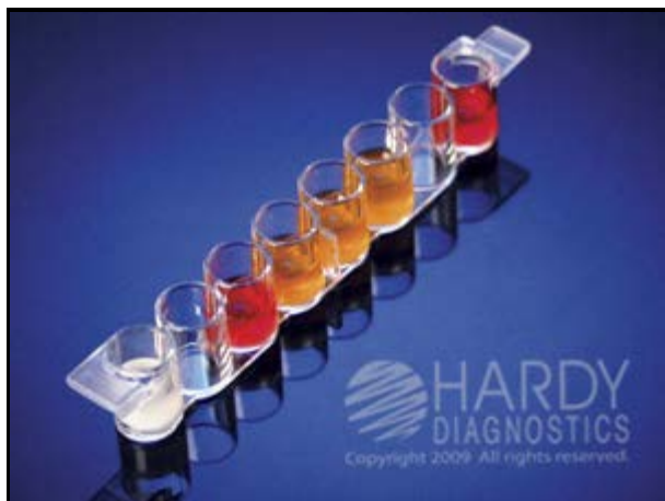
Showing results for Neisseria lactamica (ATCC® 23970) with the CarboFerm™ Neisseria Kit (Cat. no. Z98).